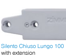
Silento Chiuso Lungo 100 with extension