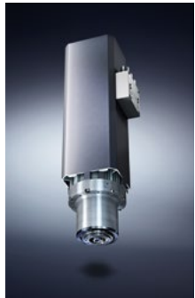
MACHINE TOOLING TECHNOLOGY