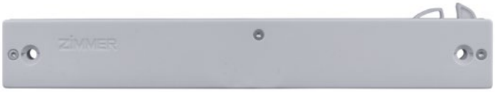
Silento Chiuso 70