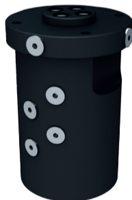
Fig. 1: DV series rotary distributor